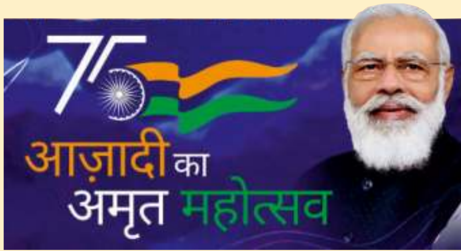
Honourable Shri. Narendra Modi Ji, Prime Minister of India

T he Azadi Ka Amrit Mahotsav means elixir of energy of independence; elixir of inspirations of the warriors of freedom struggle; elixir of new ideas and pledges; and elixir of Aatmanirbharta. Therefore, this Mahotsav is a festival of awakening of the nation; festival of fulfilling the dream of good governance; and the festival of global peace and development.